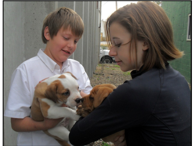
Youth Volunteers at the Pet Connection After School Project enjoyed playing with a new litter of puppies this fall. Looking to volunteer? We have opened up the most popular After School Projects for new volunteers to sign up this month. Email yvc_kc@yvca.org to sign up for a project.